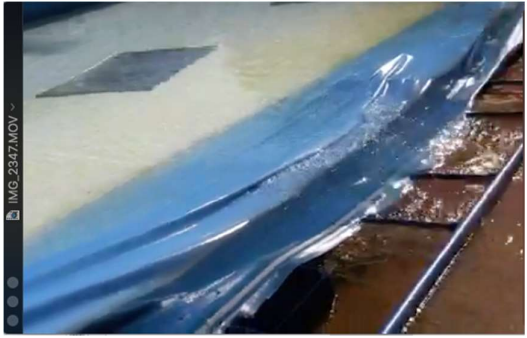
Luckily our rooms were built on stilts and the water quickly drained away into the sand.

Despite our best efforts to protect and preserve the iron frame of our 12 m portable pool, it gave way to the ravages of saltwater corrosion from the sea spray just over our sea wall. As one corner began to collapse, it over-stressed the top seam of the longest side. Between the huge tear and the frame bending over, a 50-ton mini-tsunami swept into the garden as the pool emptied in one, down to the last inch, leaving the swim mirror like a window on the floor.